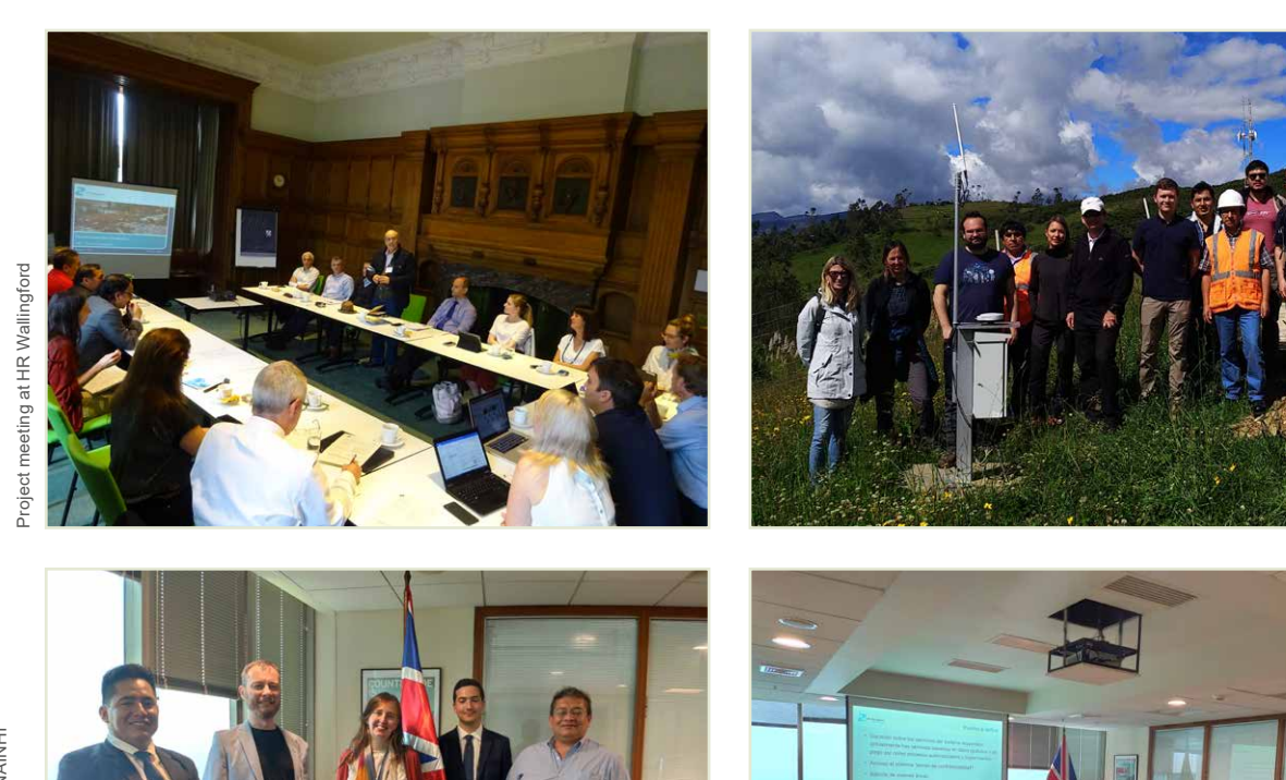
Visit of UKSA and Project Partners to Colquirrumi site managed by CIEMAM

Meeting with Peruvian stakeholders in Lima