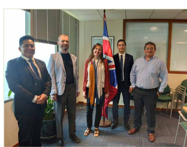
Members of HR Wallingford and FUNAINHI at the British Embassy in Lima

Meeting with Peruvian stakeholders in Lima